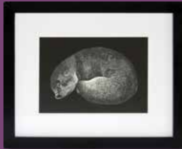
(above) 'Sleepy Sea lion' scraperboard by Mary Woolaway $185