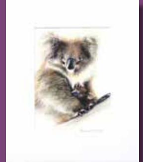
(above) 'Mummy & Me' pencil drawing (unframed with matt) by Diana Bradshaw $90