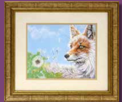
(right) 'Fox in the Wind' acrylic by Donna Staehr $180